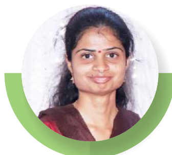
Nayana Patil Karyalay