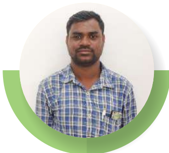
Dilip Ghatal Vistarak, Vibhag 5