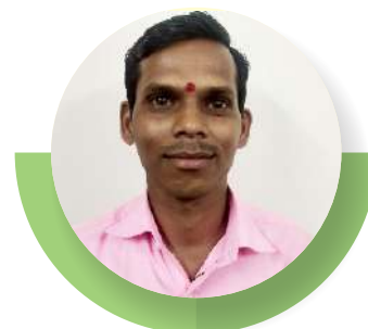
Vijay Dhapsi Vistarak, Vibhag 3