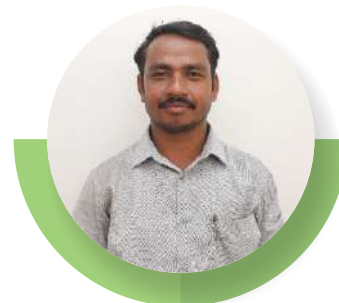
Kailas Kurkute Vistarak, Vibhag 6