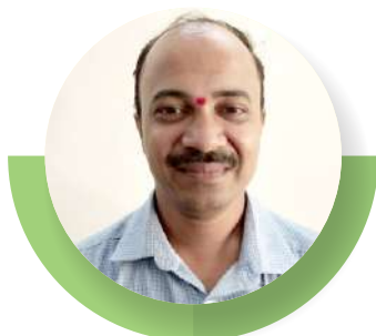
Bharat Nipurte Vistarak, Vibhag 1